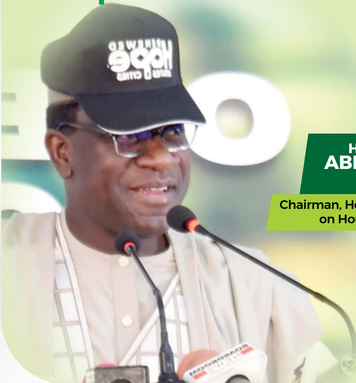
HONORABLE ABDULMUMIN JIBRIN

We have seen how well the Honouble Ministers have taken on the task in the last one year, building houses in thousands and also looking to provide social housing as well through the National Social Housing Fund. I am so excited about that initiative because it touches the heart of the matter. I understand that there will be a Bill sent to the National Assembly in this regard. Let me assure the Ministers that we will give it the urgency it deserves and ensure you get the full support of the Committees and the National Assembly to do your work for the benefit of Nigerians.